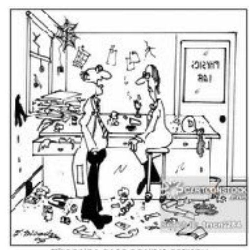
"Ceaning goes against entropy and the natural order."